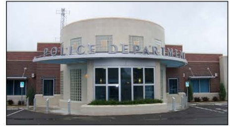
Andover Police Department