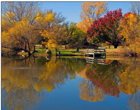
Andover Central Park

The Andover Unified School District No. 385 ( www.USD385.org ) spans 47 square miles in Butler and Sedgwick counties with more than 5,300 students that attend six elementary, two middle, and two high schools both located within Andover's city limits. The school